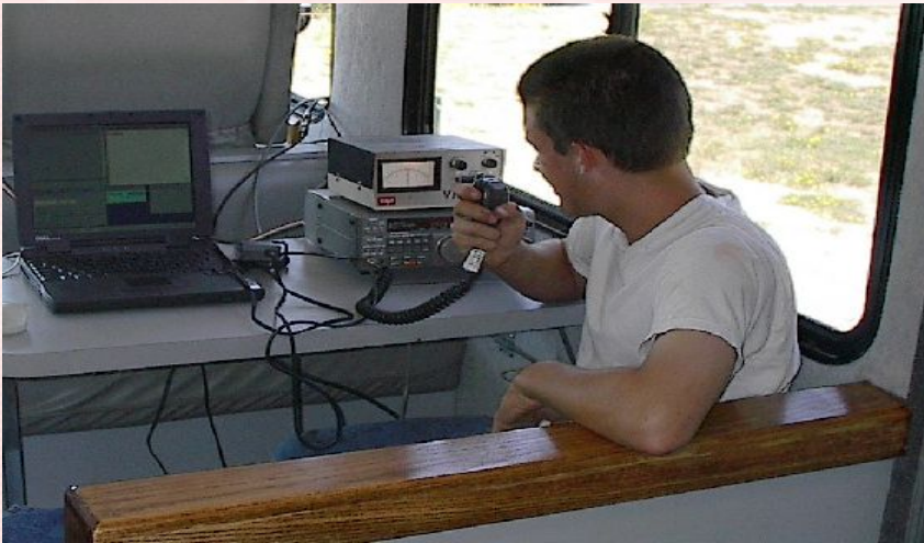
A control operator